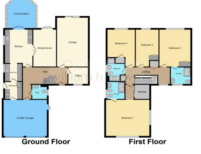
This floor plan is for illustrative purposes only. It is not drawn to scale. Any measurements, floor areas (including any total floor area), openings and orientation are app details are guaranteed, they cannot be relied upon for any purpose and they do not form part of any agreement. No liability is taken for any error, omission or misstate must rely uono its own inspection(s). Powered by www.focalaendr.