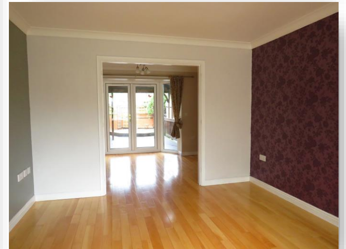
Greenwood Way, Wimblington PE15 0NY