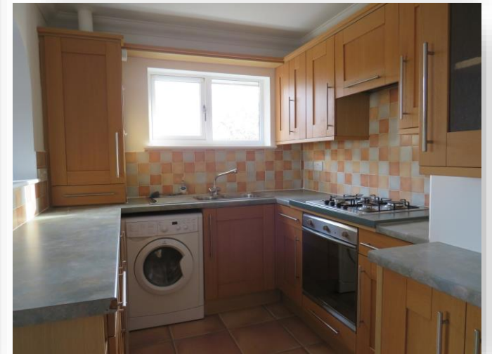
7 Hemmings Court, The Birches, March PE15 8DQ