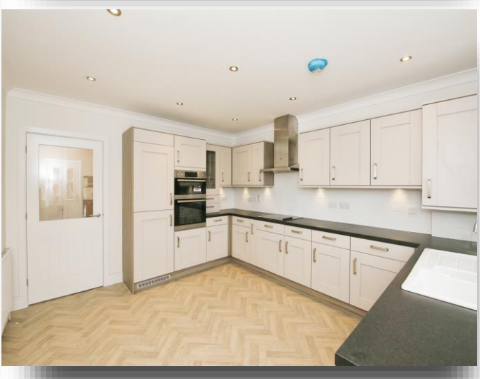
Plot 213 Willow Gardens, King Street, Wimblington PE15 0QF