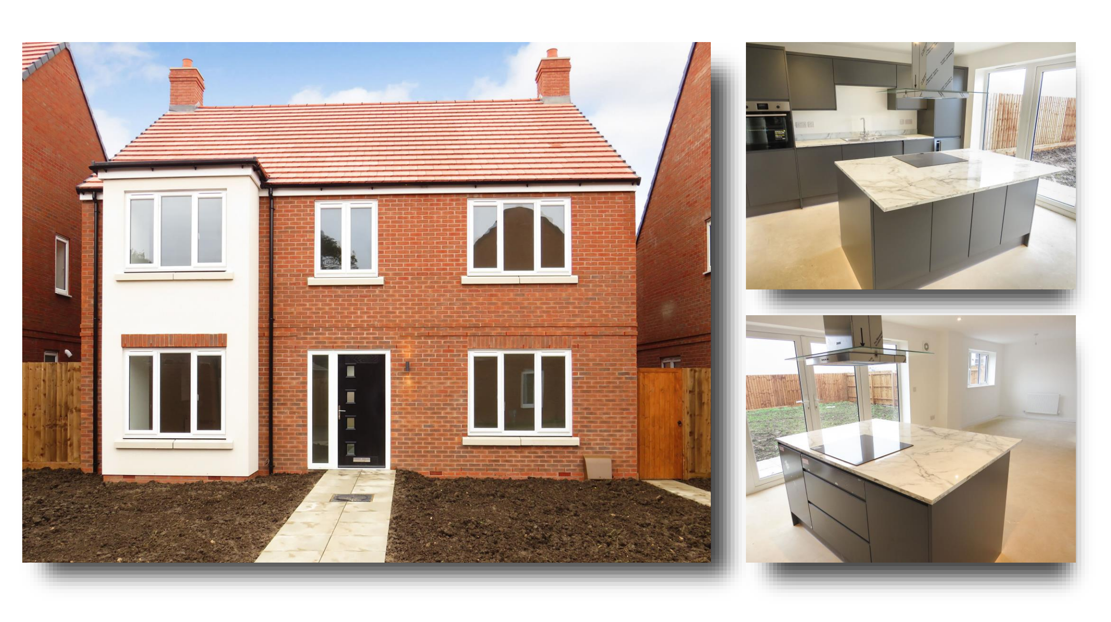
Plot 15, Regal Fields, Berryfield, PE15 8PN