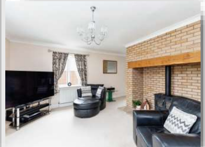
Estover Road, March PE15 8SF