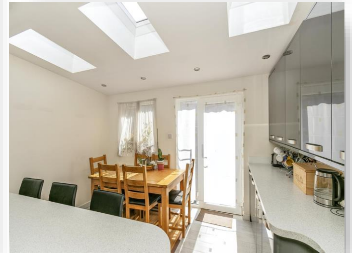
Sixpenny Close, Poole BH12 4BF