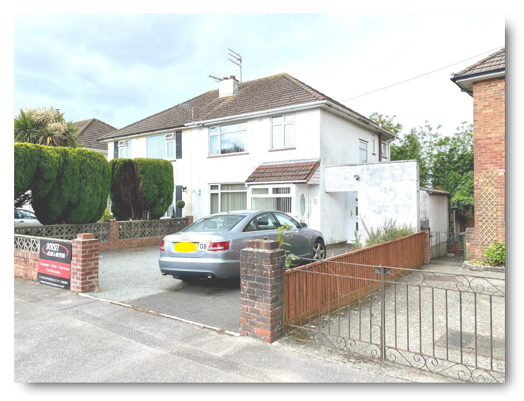
Benbow Crescent, Poole BH12 5AH