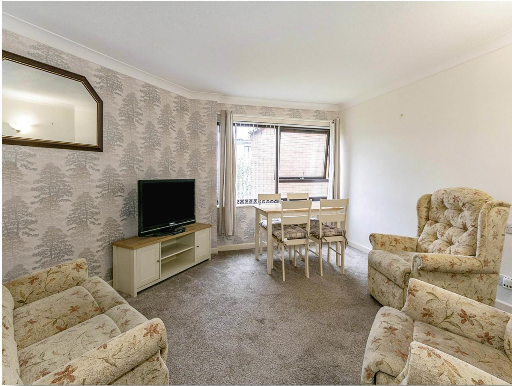
Homedene House Seldown Road, POOLE BH15 1UJ