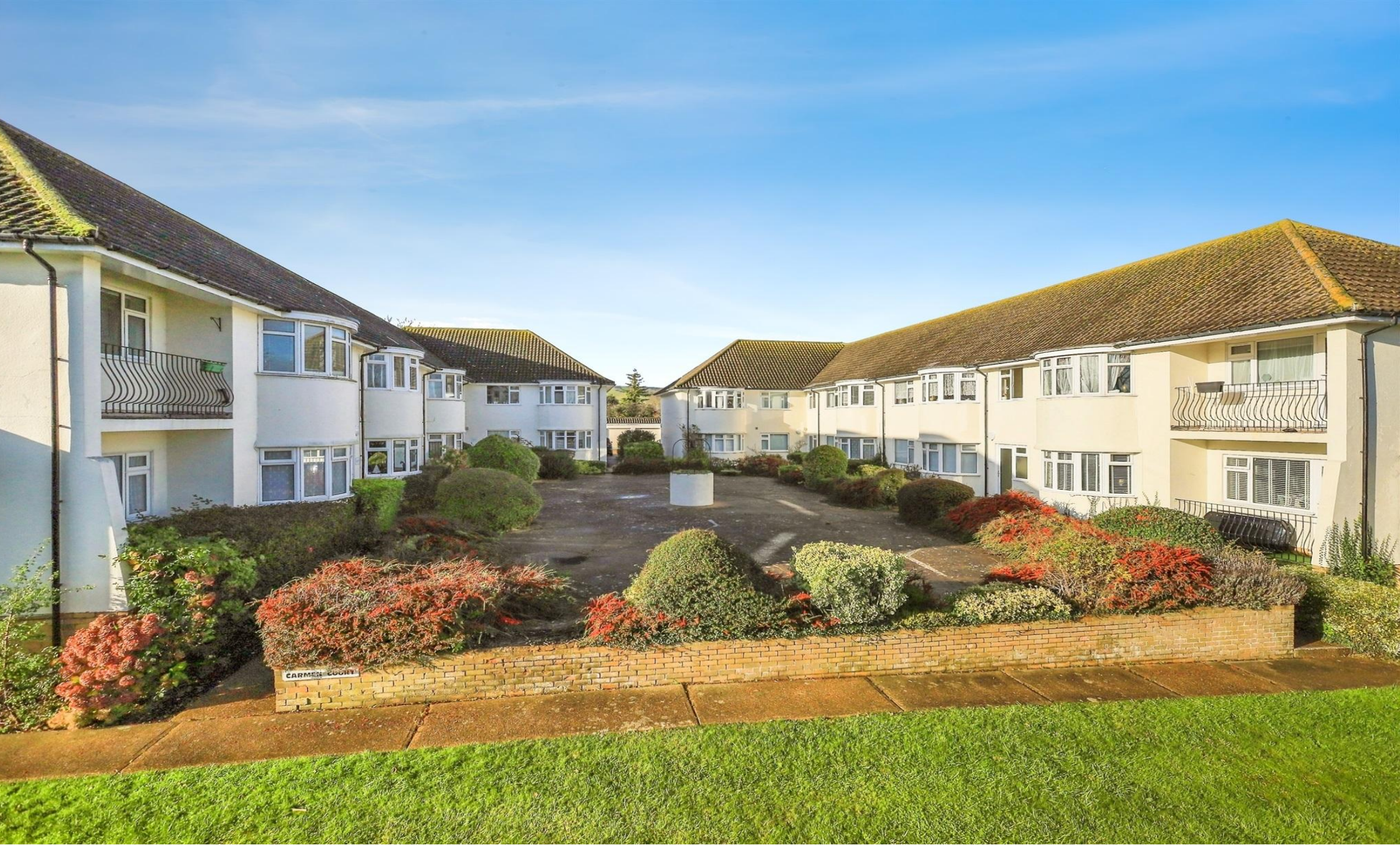
Carmen Court Eastbourne Road, Willingdon Eastbourne BN20 9NP