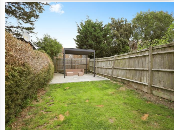
Victoria Road, Polegate BN26 6DB