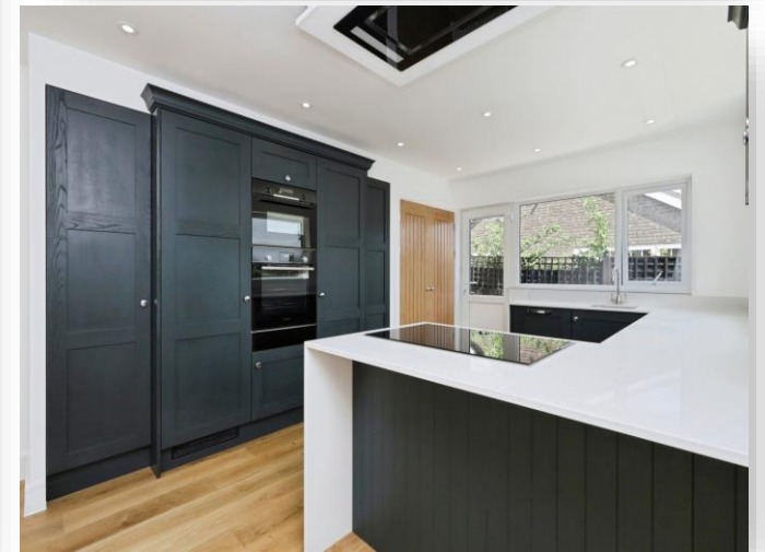
Mill Way, Polegate BN26 5NH