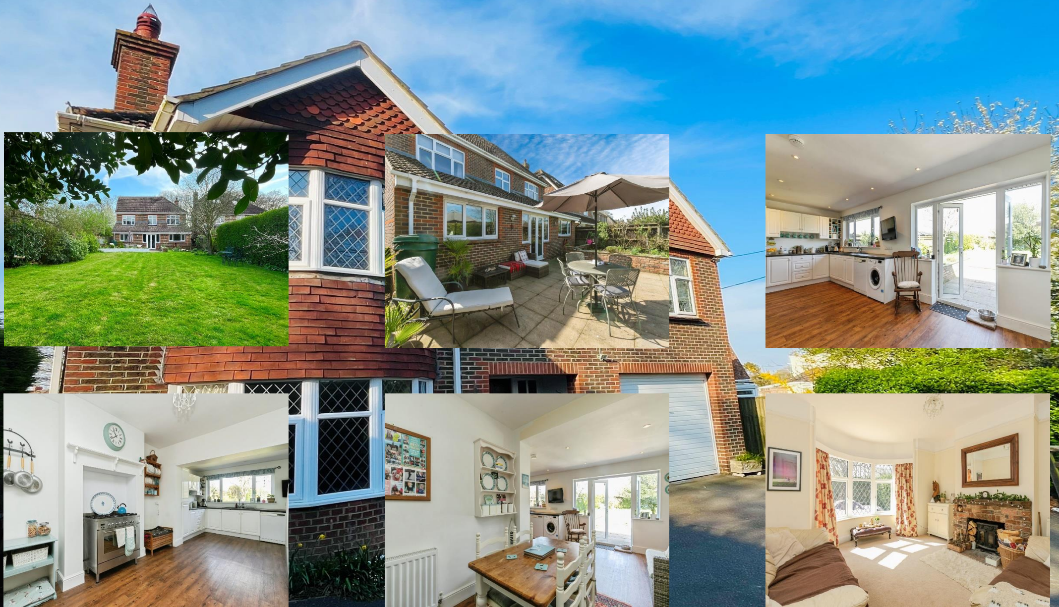
Pevensey Road, Polegate BN26 6HJ