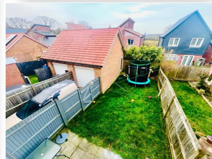
Sunflower Lane, Polegate BN26 6FD