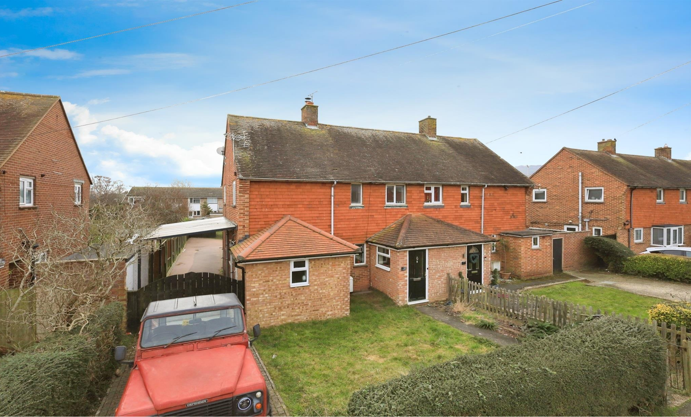
Park Croft, Polegate BN26 5LB