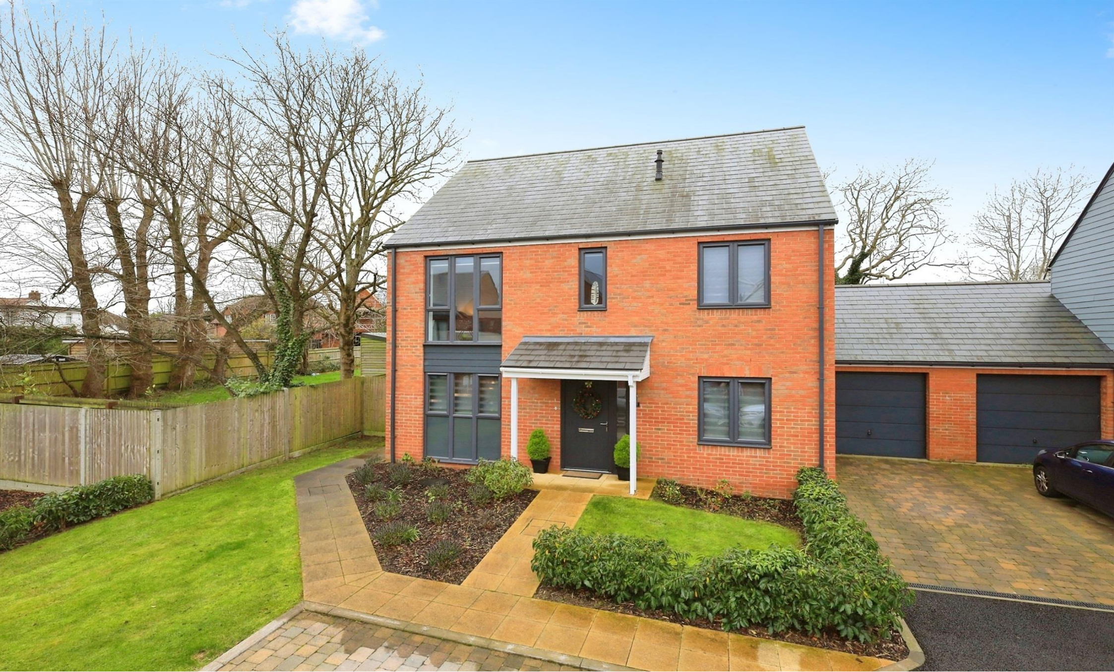
Birch Road, Polegate BN26 6GJ