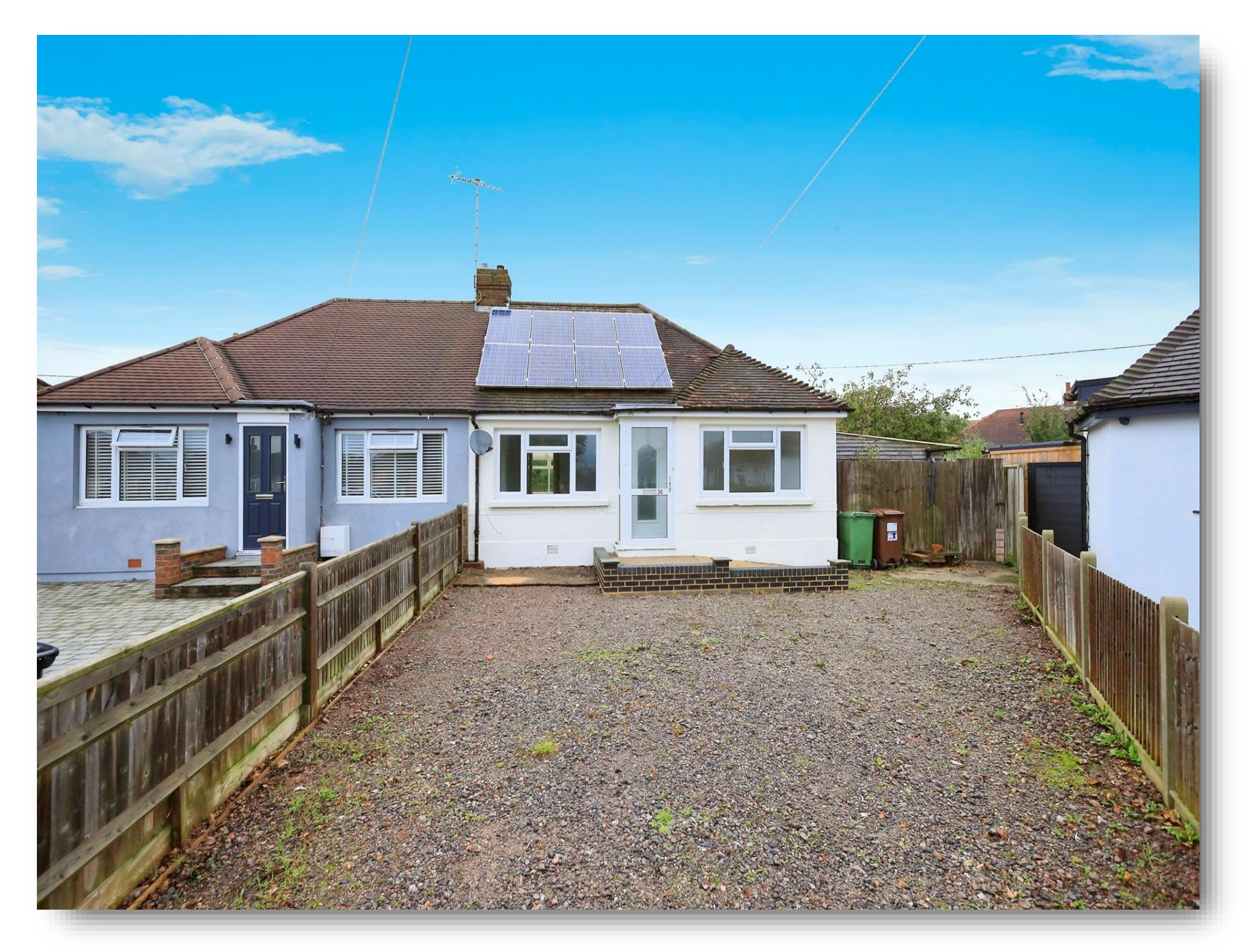
Central Avenue, Polegate BN26 6HA