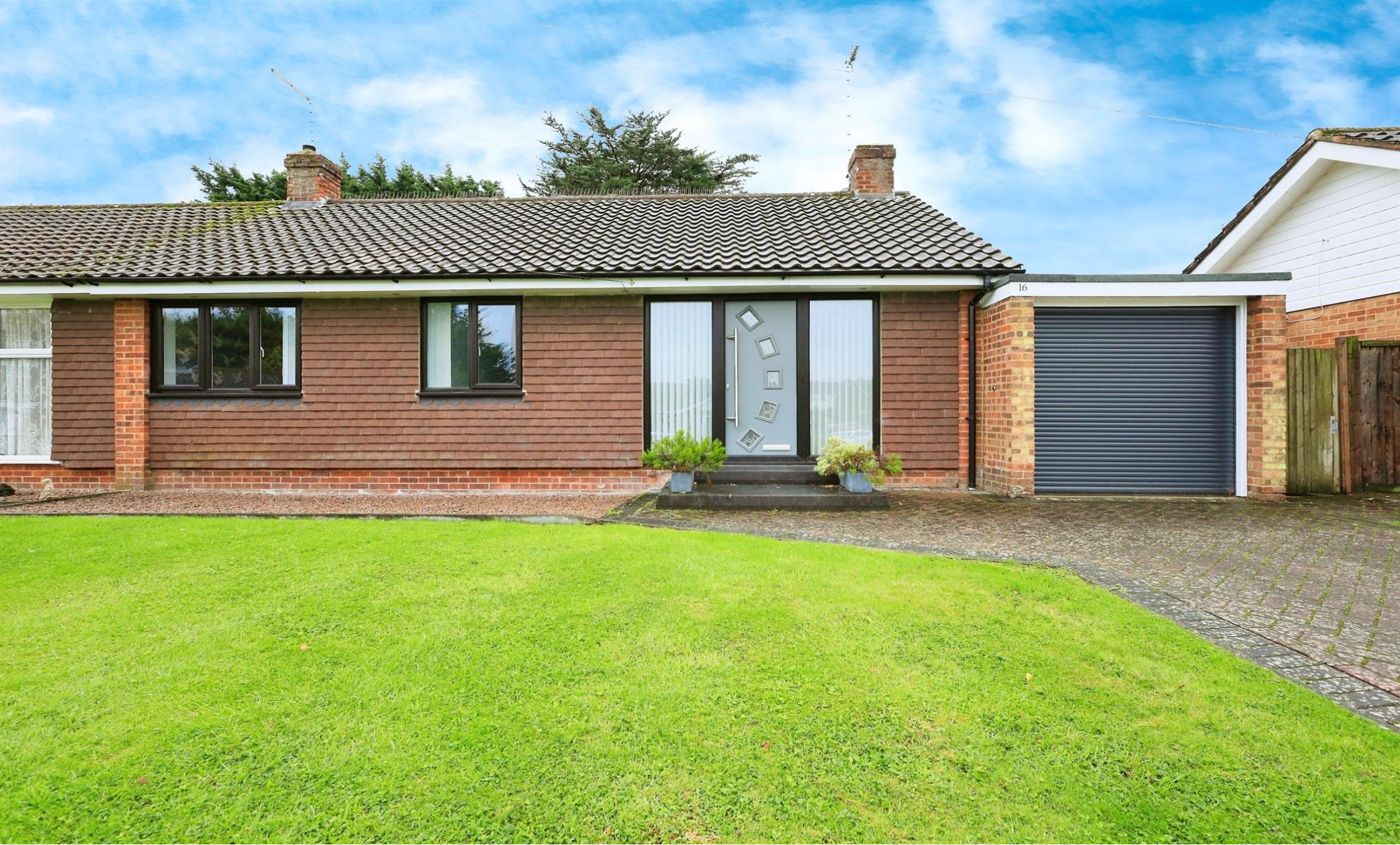
Gosford Way, Polegate BN26 6DS