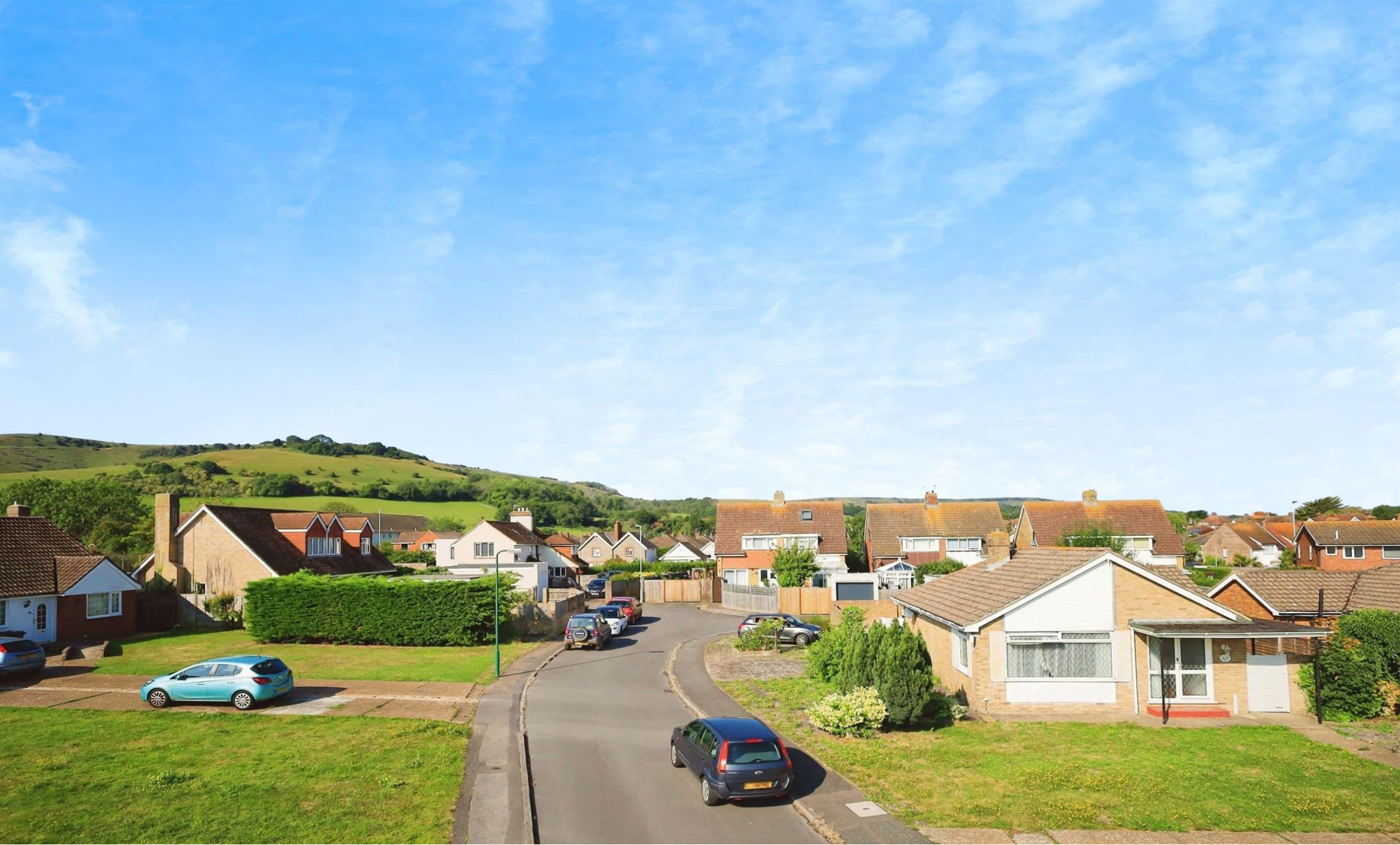
Went Hill Gardens, Eastbourne BN22 0QP