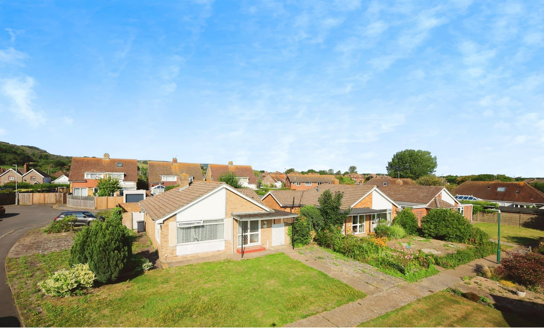
Went Hill Gardens, Eastbourne BN22 0QP