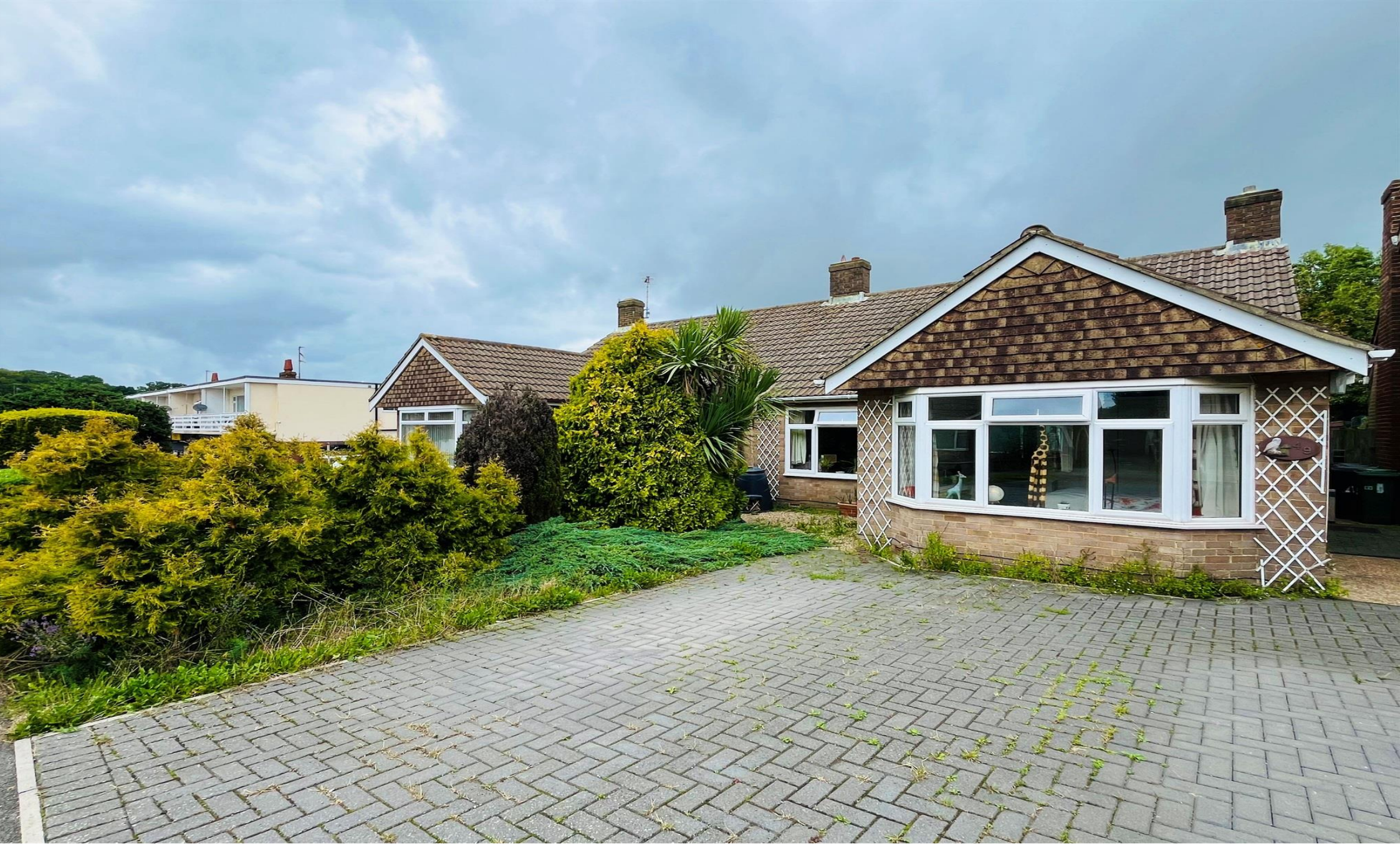
Farmlands Way, Polegate BN26 5LN