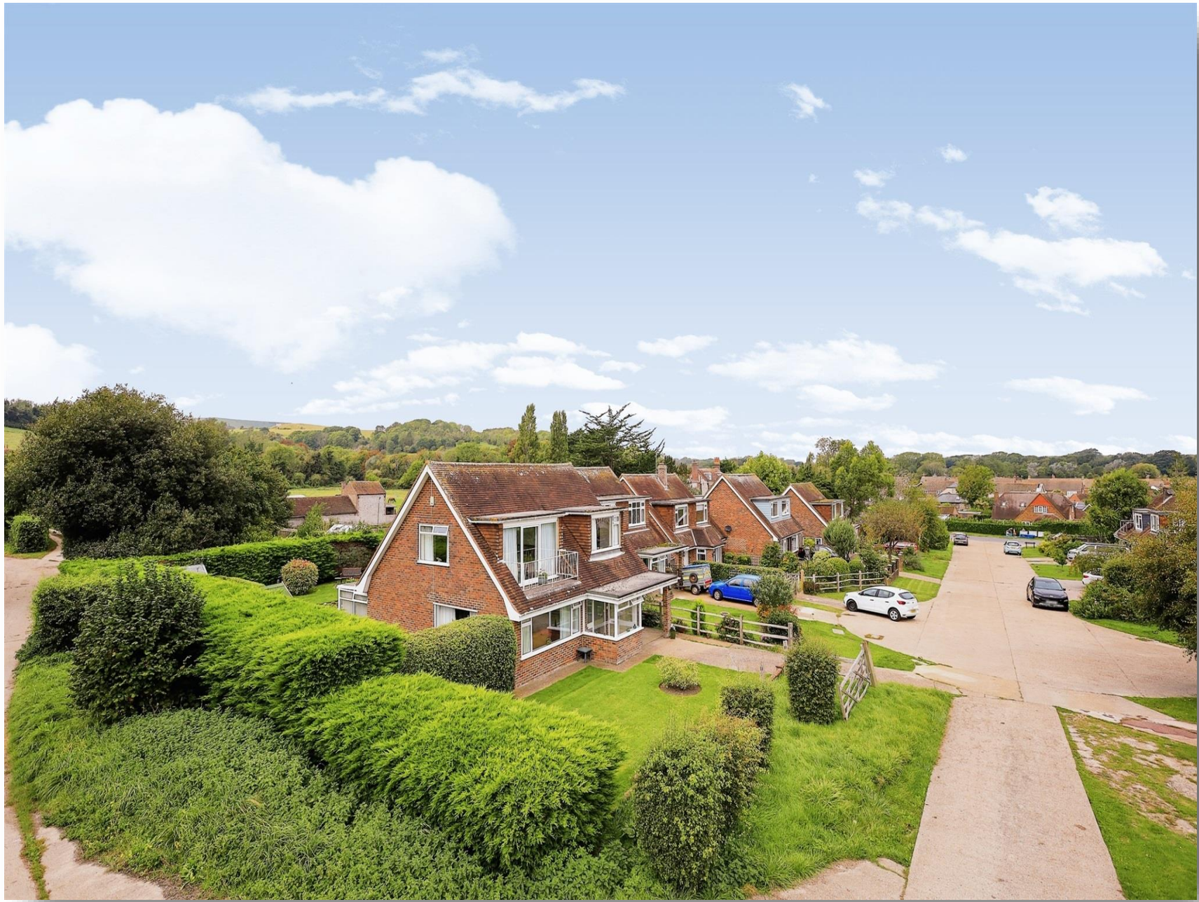
Filching Close, Polegate BN26 5NU