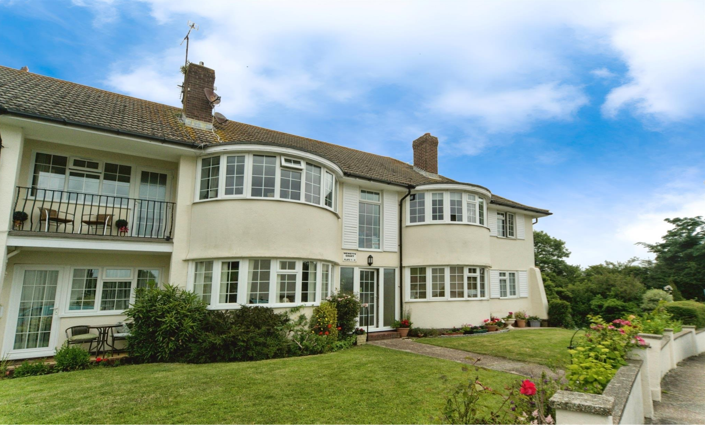
Mewetts Court, Meachants Lane, Eastbourne BN20 9LS