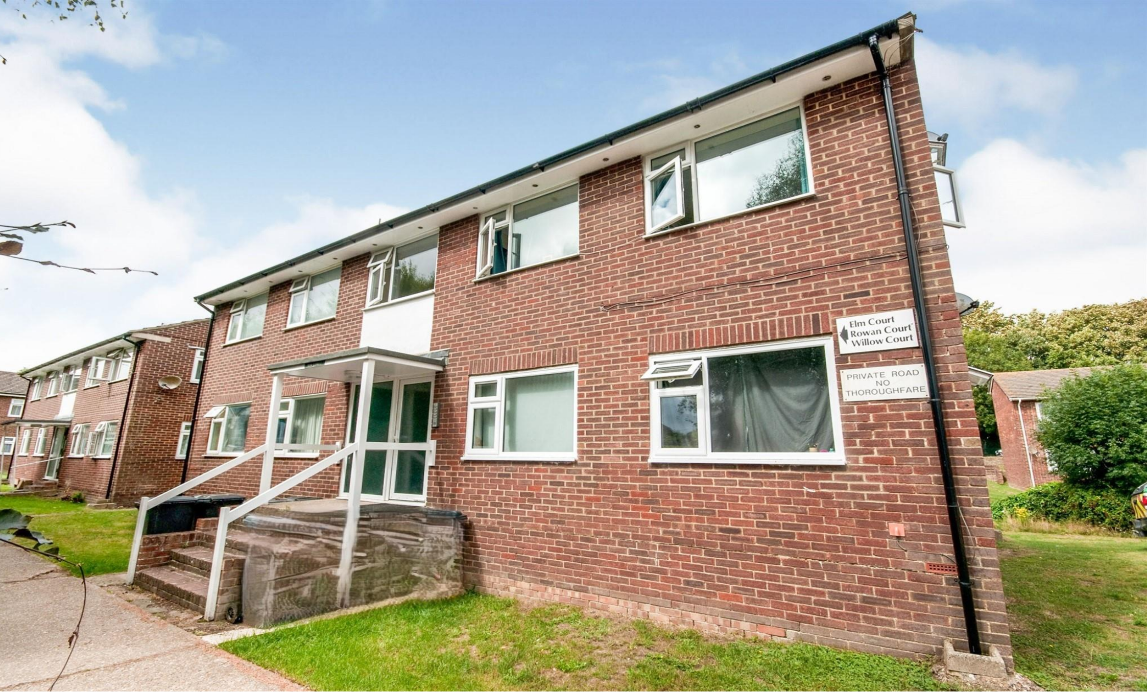
Elm Court Walnut Walk, Polegate BN26 5AG