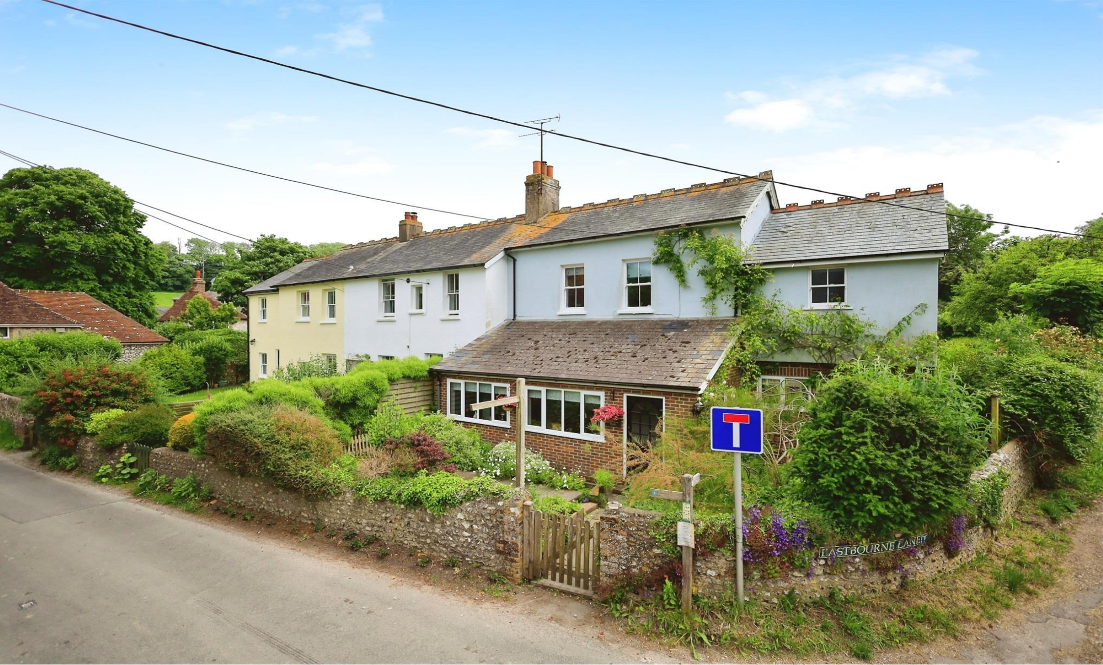
Hawthorn Lodge Jevington Road, Jevington Polegate BN26 5QJ