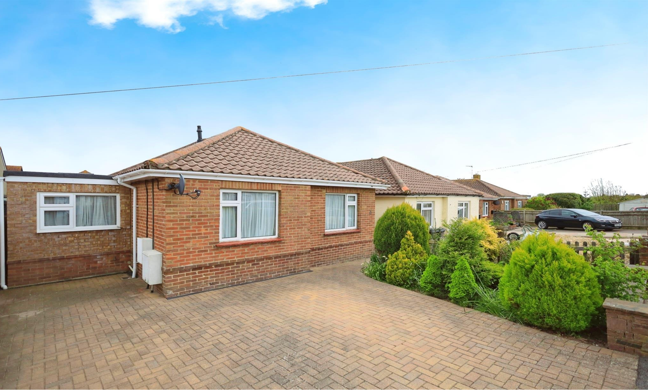
Broadview Close, EASTBOURNE BN20 9RB