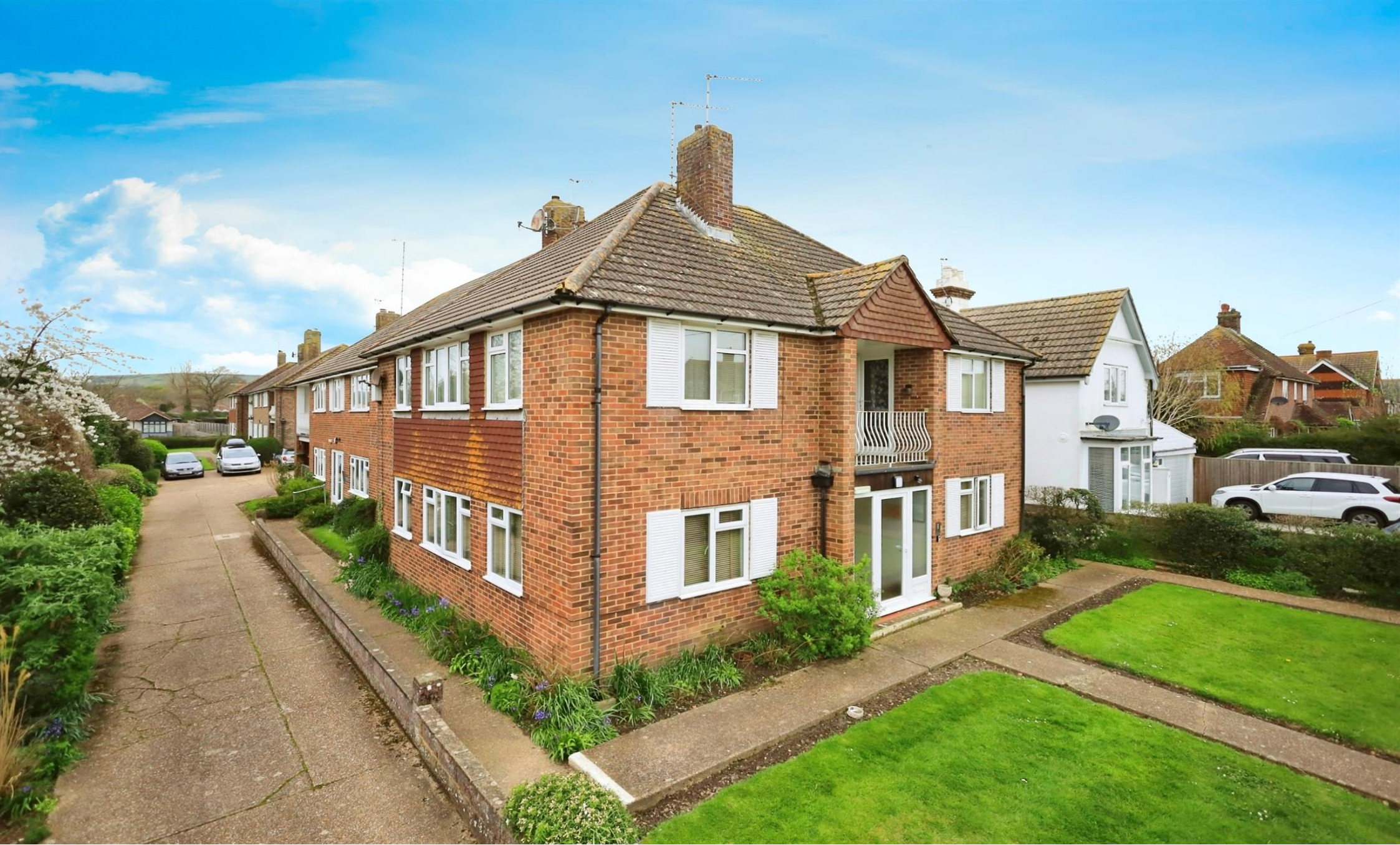
Hadley Court Church Road, Polegate BN26 5BY