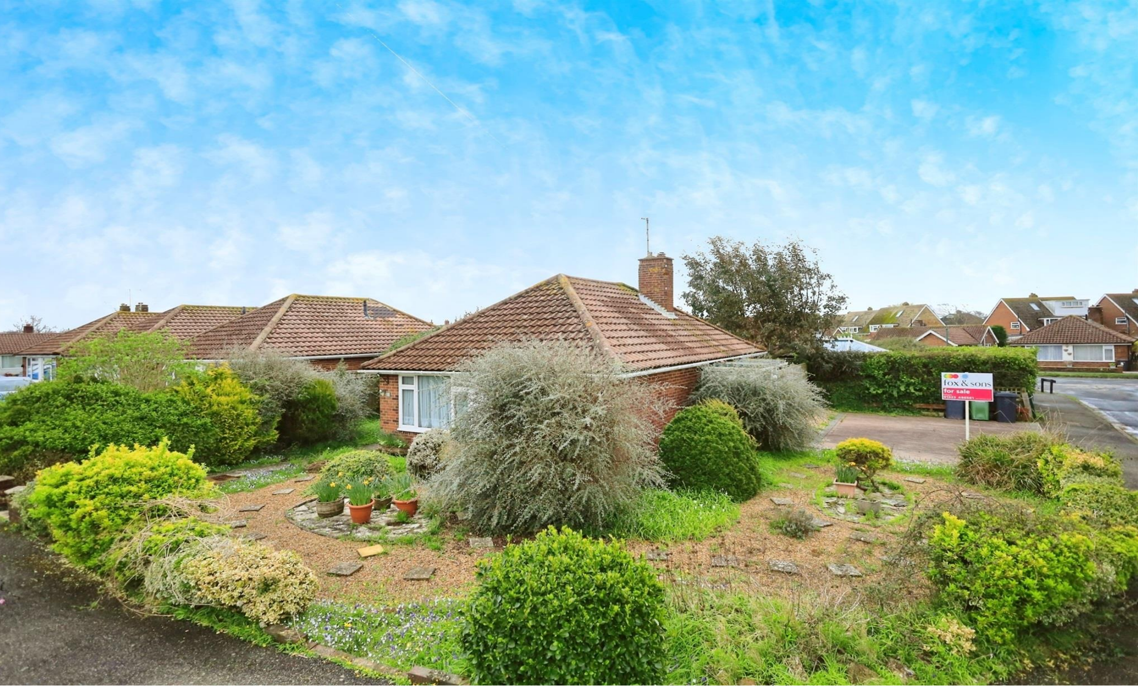
Croft Close, Polegate BN26 5LE