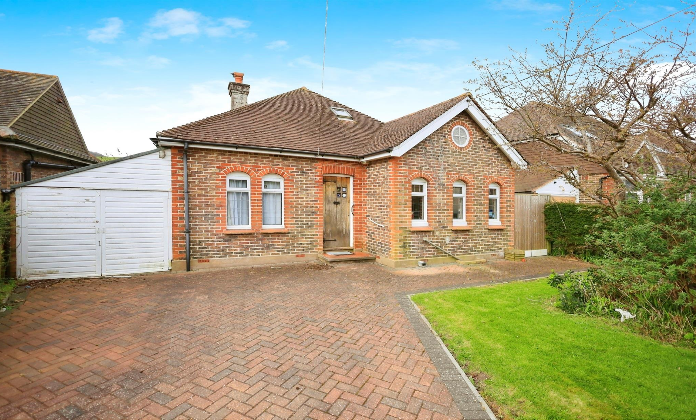
The Paragon, Wannock Lane Eastbourne BN20 9SH