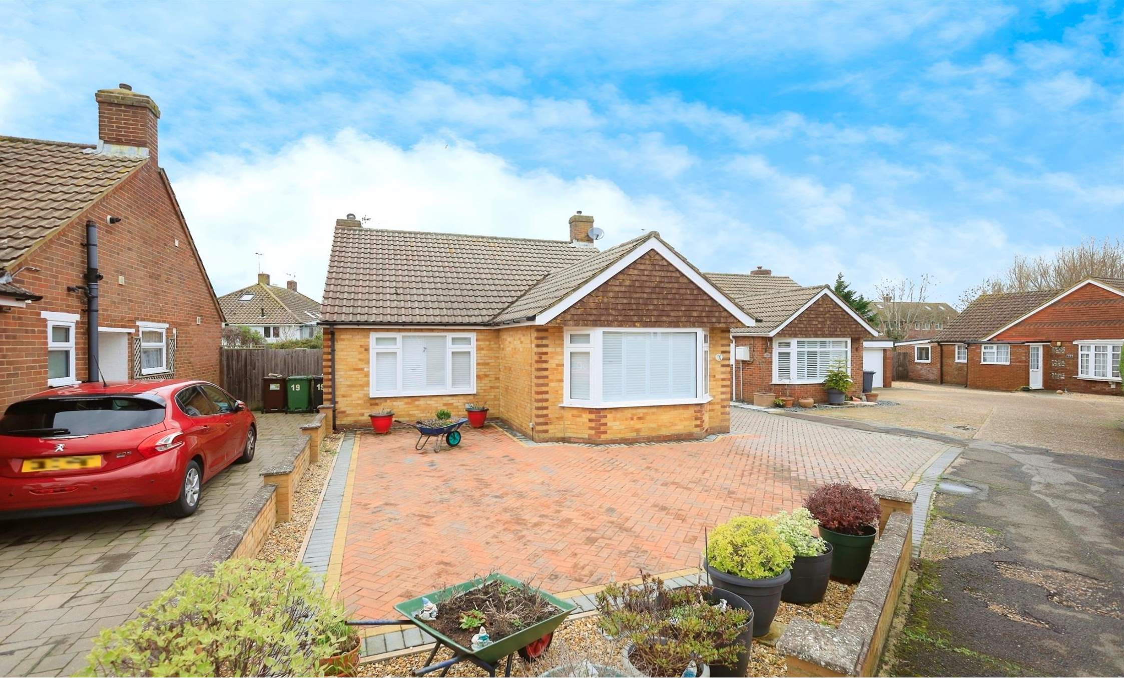
The Millrace, Polegate BN26 5LP