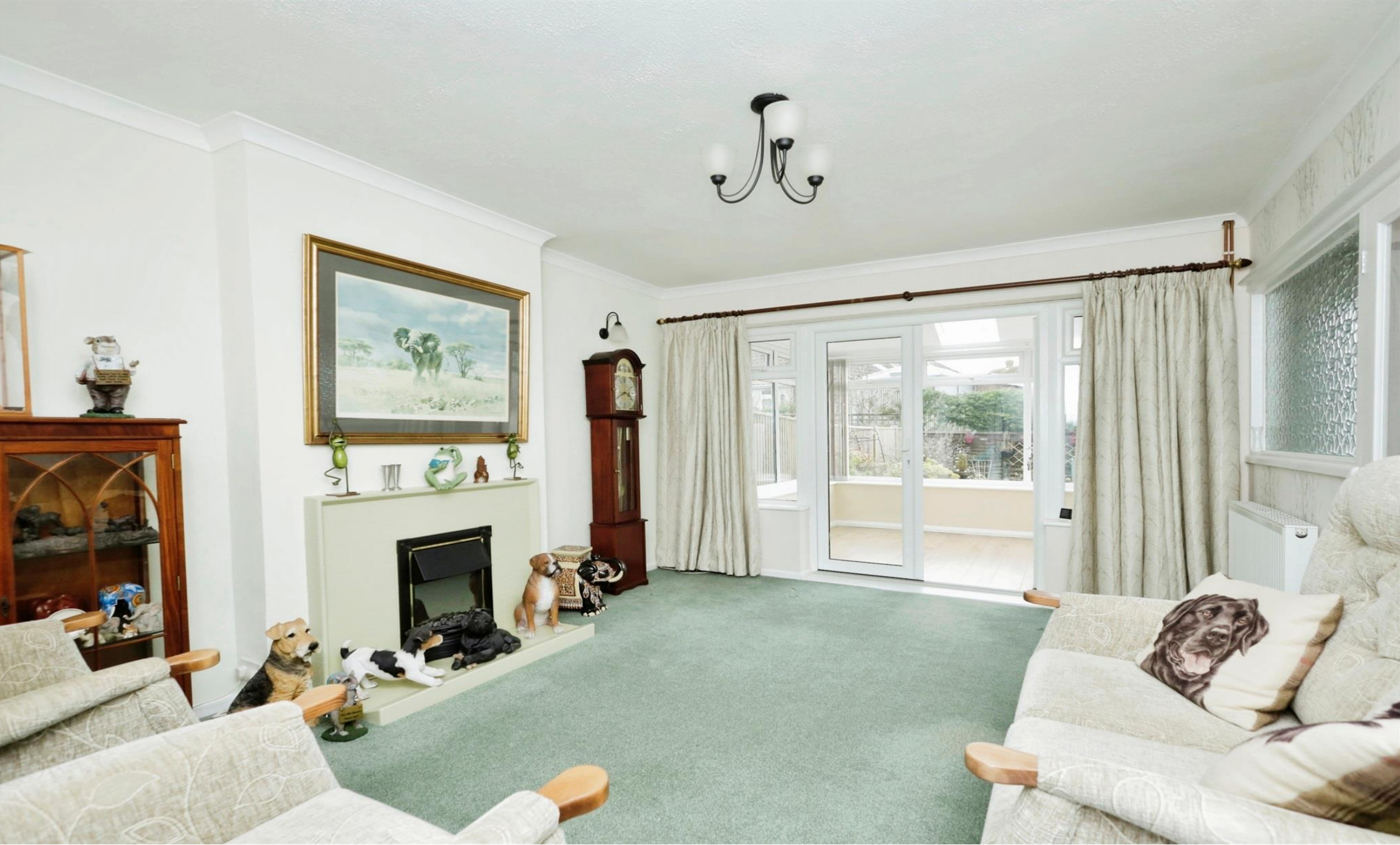
The Millrace, Polegate BN26 5LP