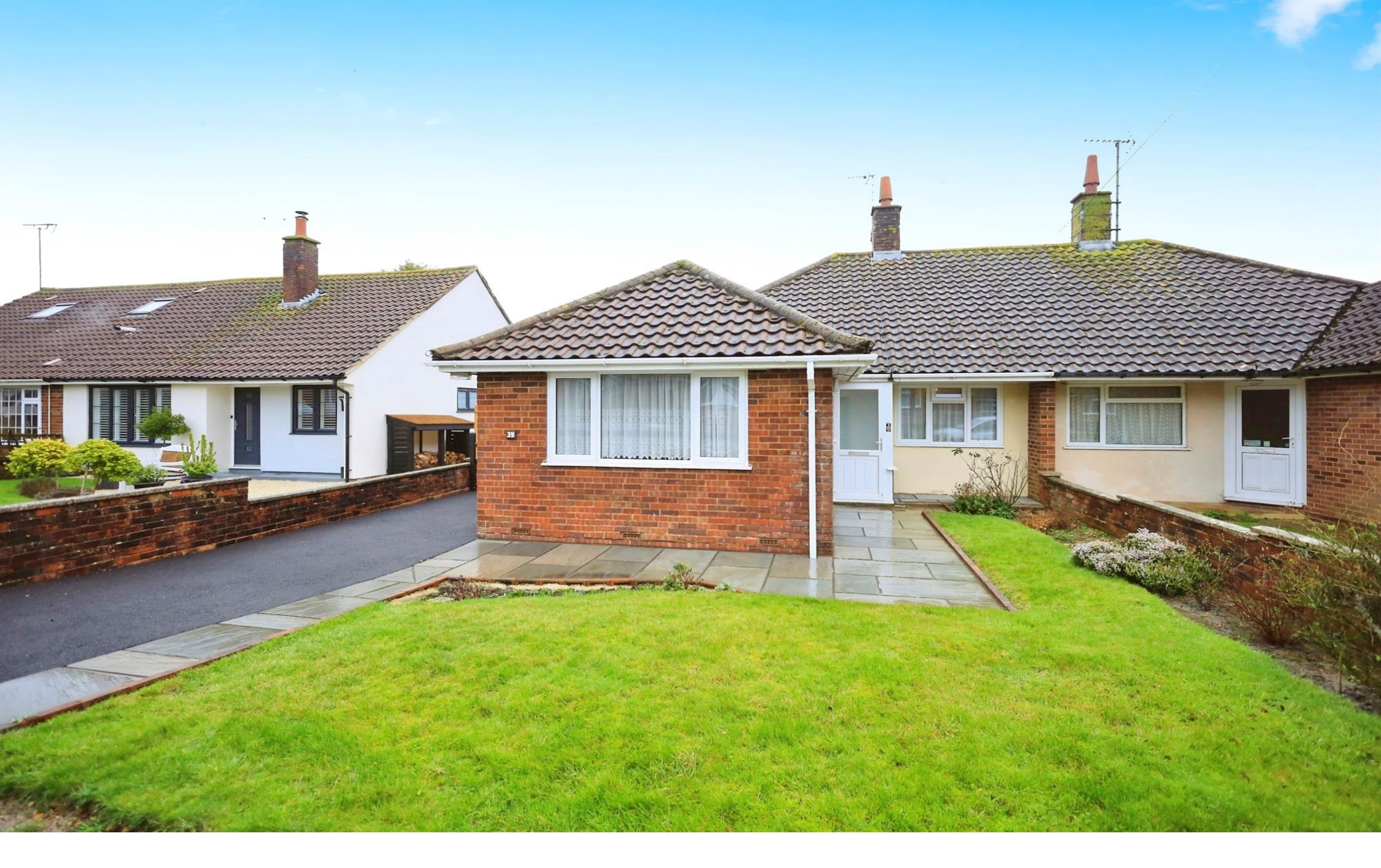
Westfield Close, Polegate BN26 6EJ