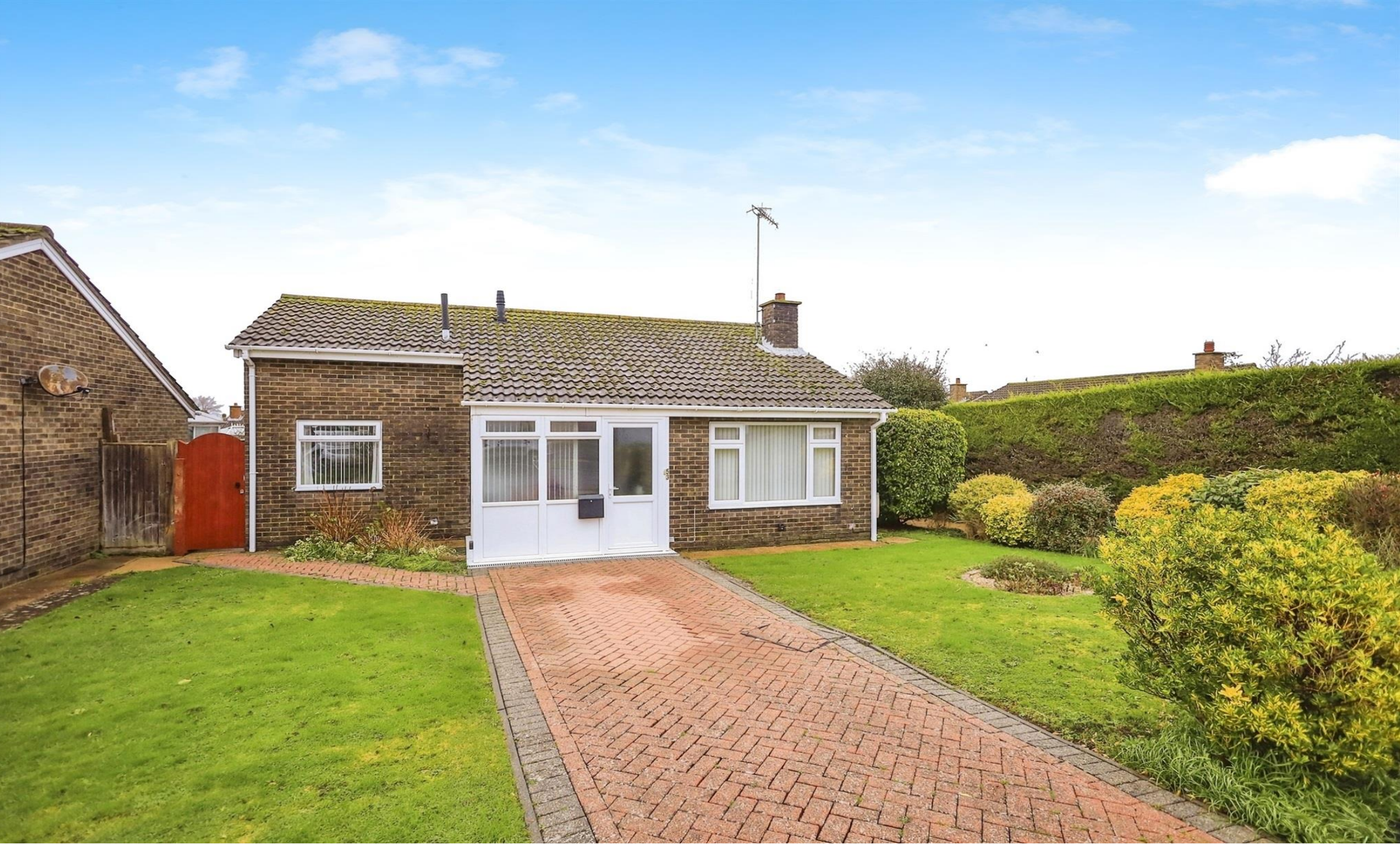
Anderida Road, Eastbourne BN22 0PZ