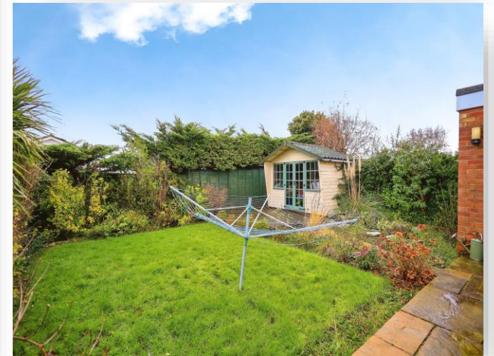
Berwick Close, Eastbourne BN22 0TA