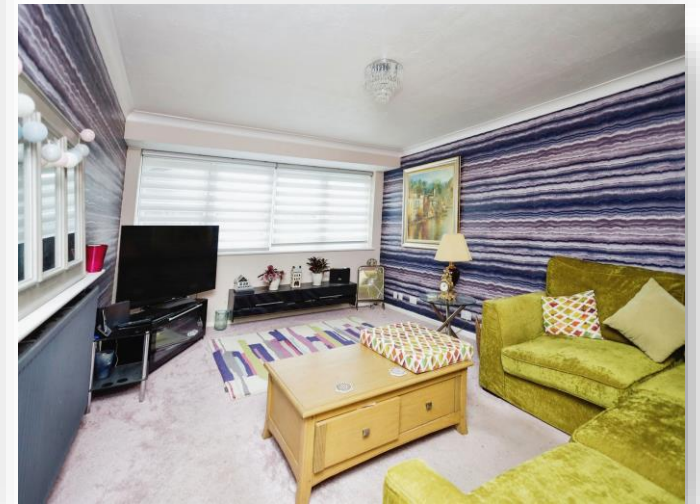
Berwick Close, Eastbourne BN22 0TA