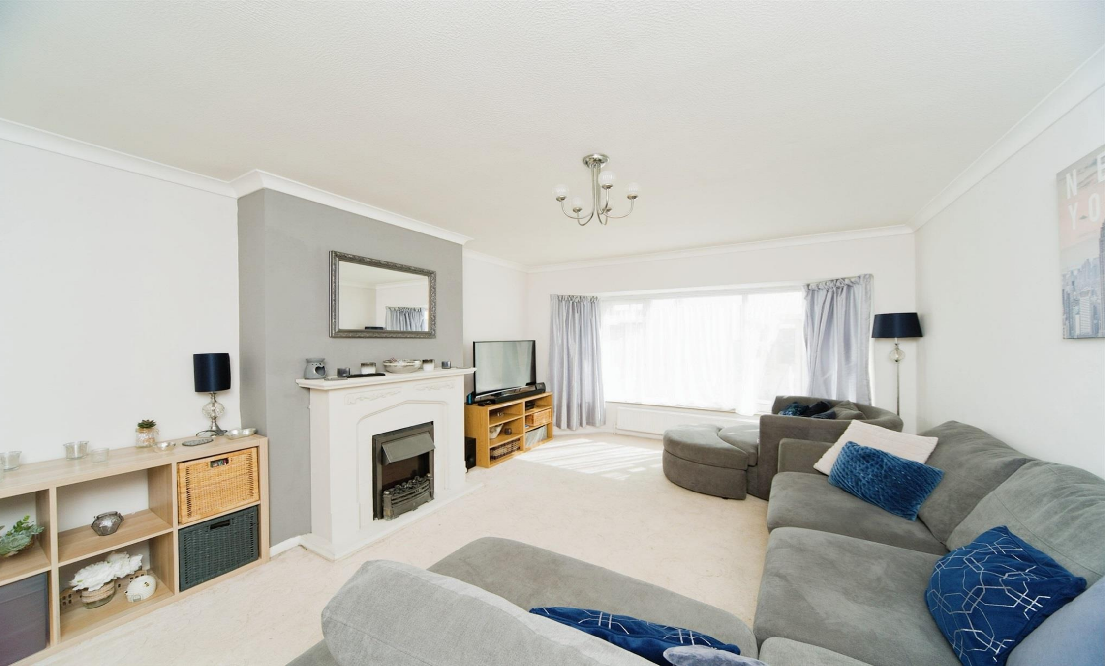
Greenleaf Gardens, Polegate BN26 6PB