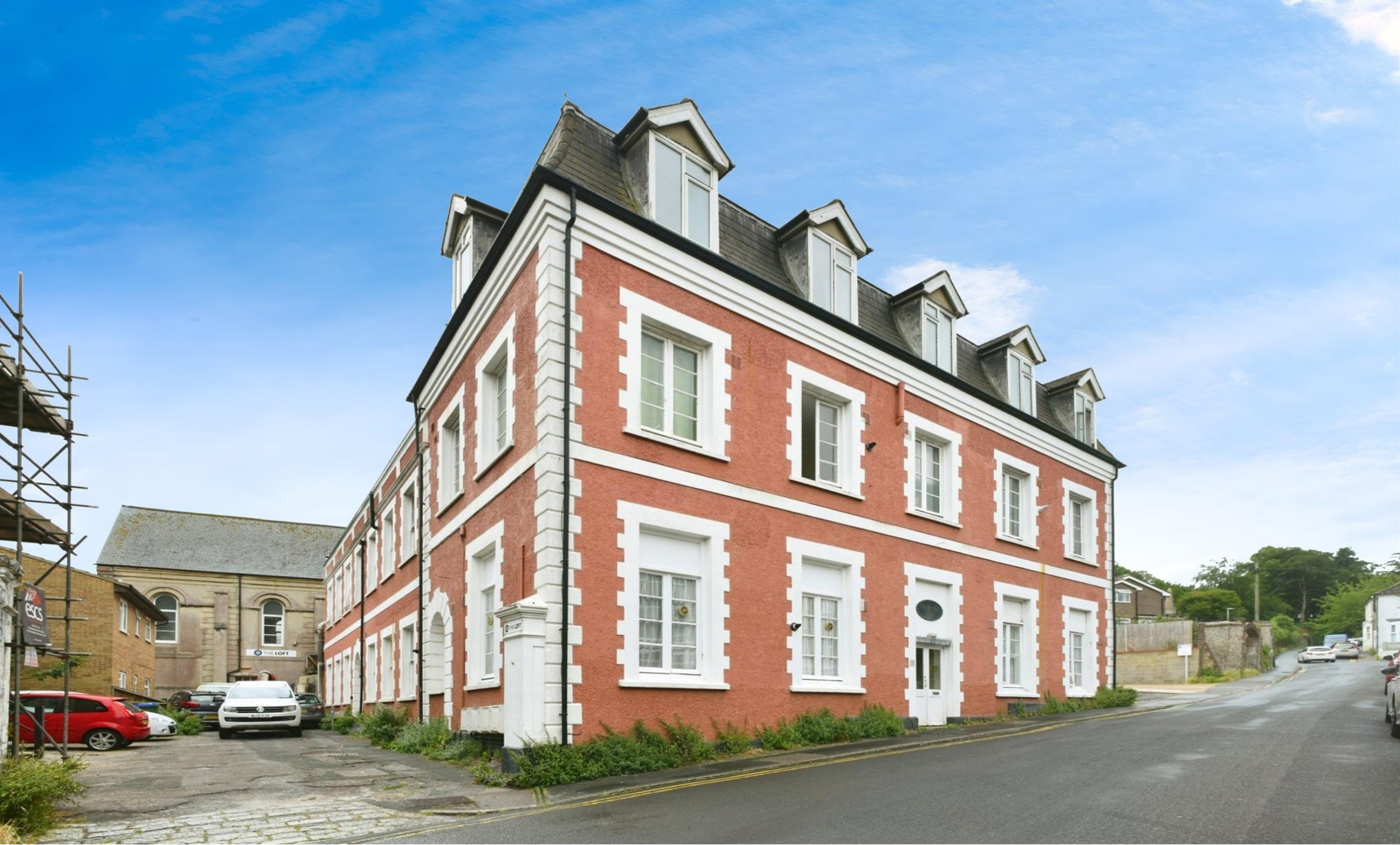
Church Hill Lodge Church Hill, Newhaven BN9 9LQ