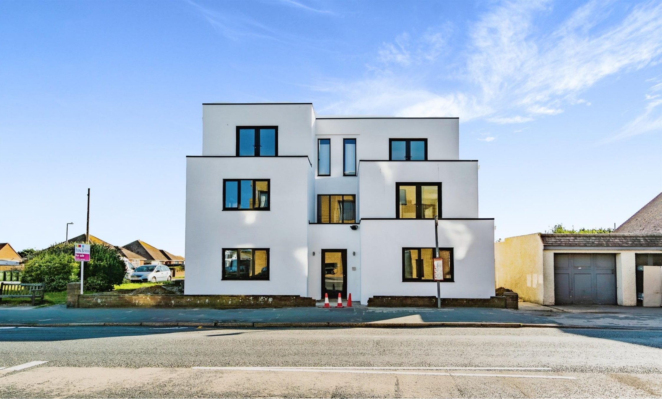
Caxton House South Coast Road,Peacehaven BN10 8NN