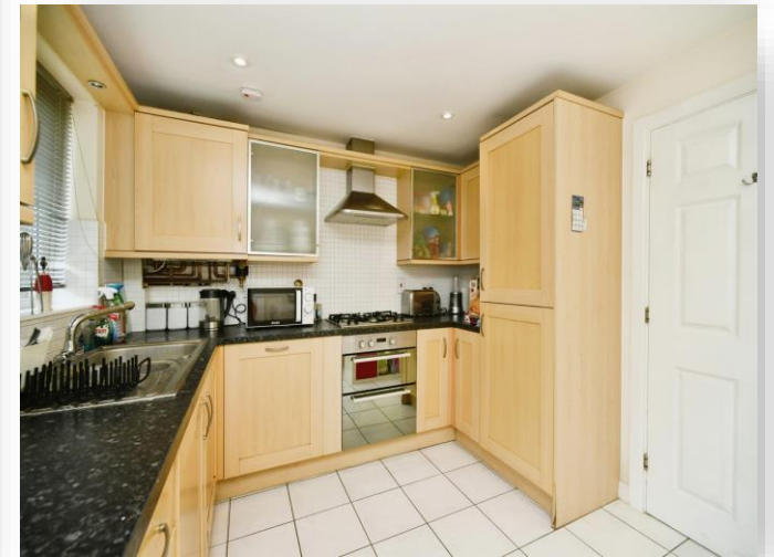
Roundhouse Crescent, Peacehaven BN10 8GL