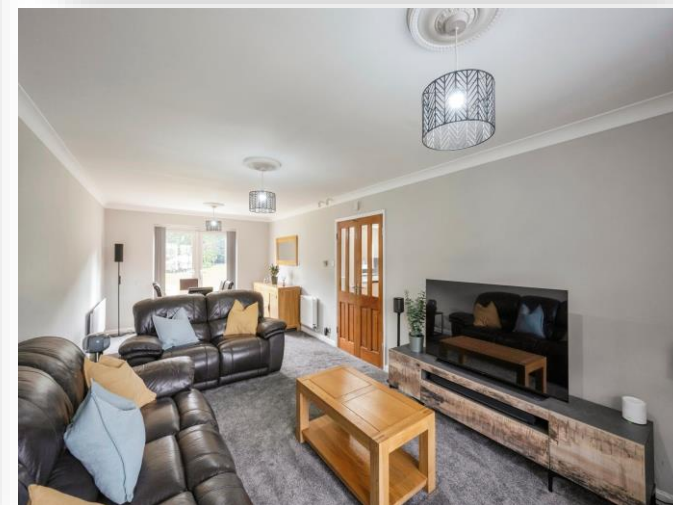
Birch Green Close, Maltby Rotherham S66 8RP