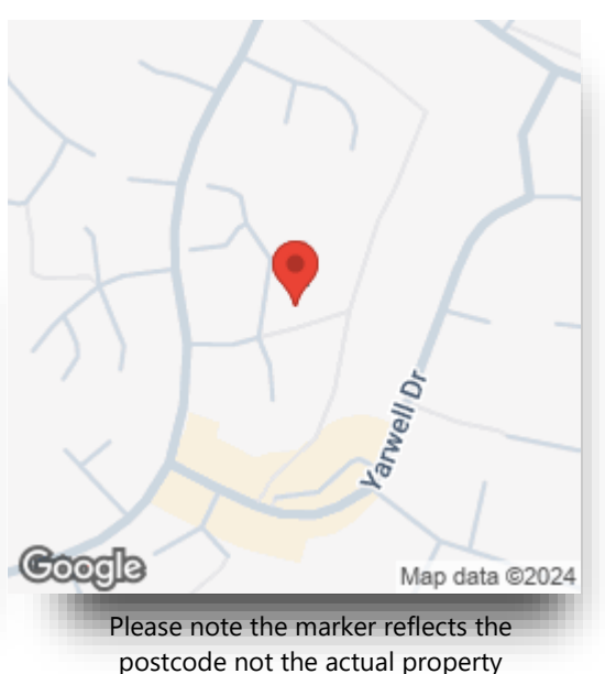
view this property online williamhbrown.co.uk/Property/MBY105927