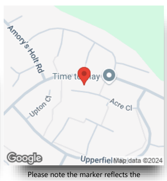
postcode not the actual property