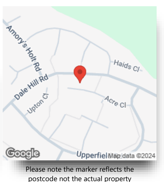
view this property online williamhbrown.co.uk/Property/MBY105771