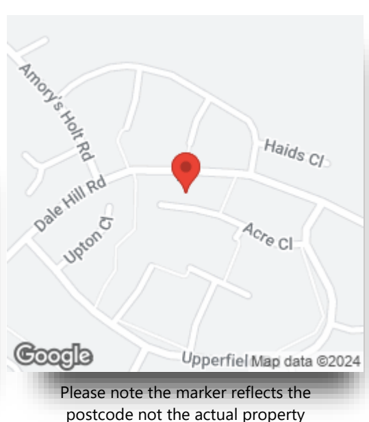
view this property online williamhbrown.co.uk/Property/MBY105776