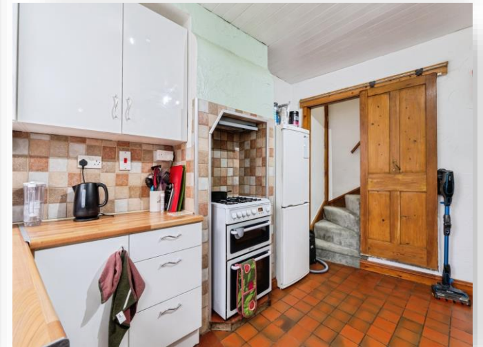
Hastings Street, Loughborough