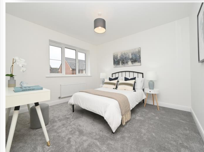
Healy Close, Sileby