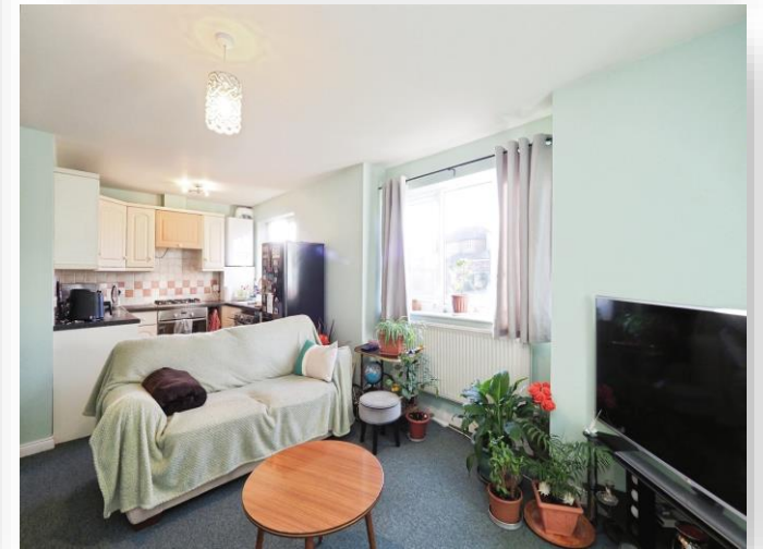
Cliff Avenue, Loughborough LE11 5HH