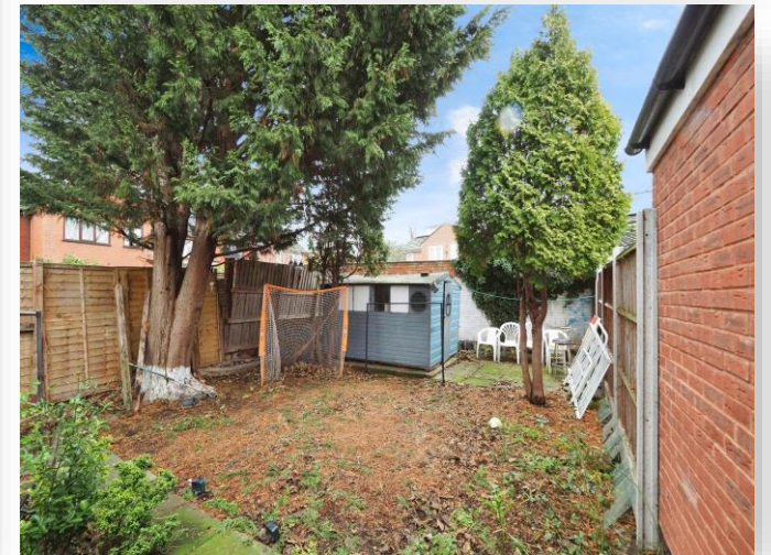
Boyer Street, Loughborough