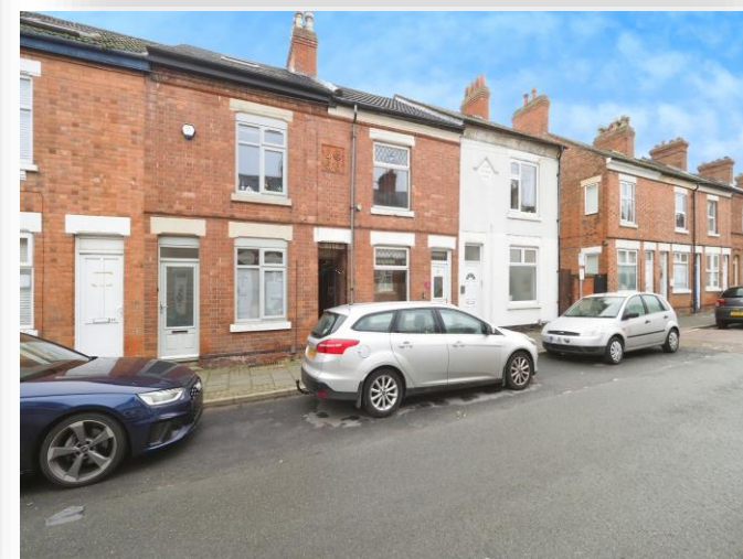
Station Street, Loughborough LE11 5ED