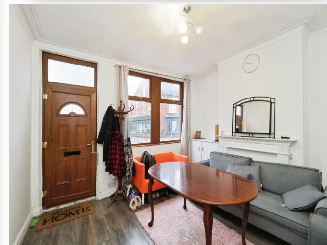
Queens Road, Loughborough